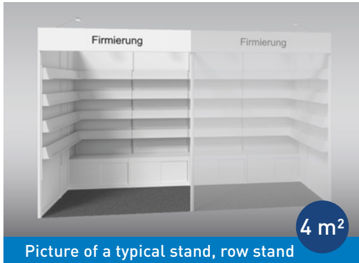
Picture of a typical stand, row stand