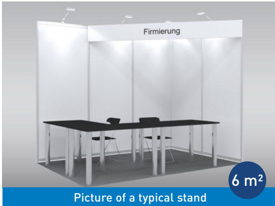
Picture of a typical stand