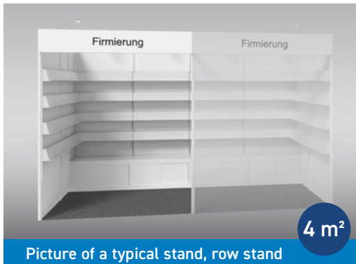
Picture of a typical stand, row stand