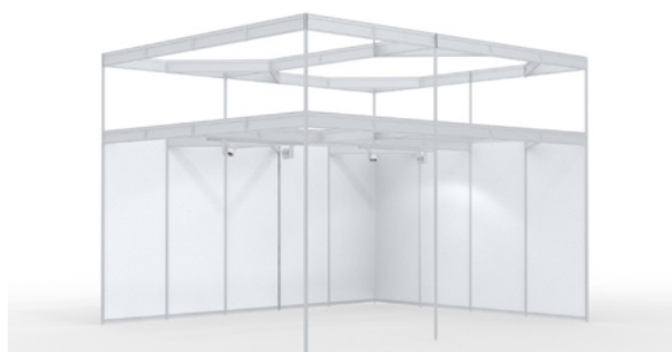
Example illustration CORNER STAND, 20 m 2 with extra high (possible for an extra charge)